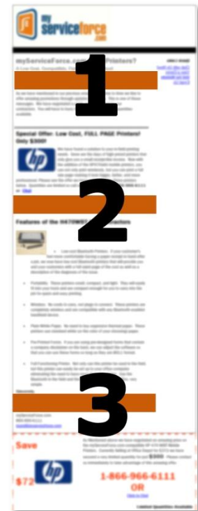
Portal Newsletter Placements