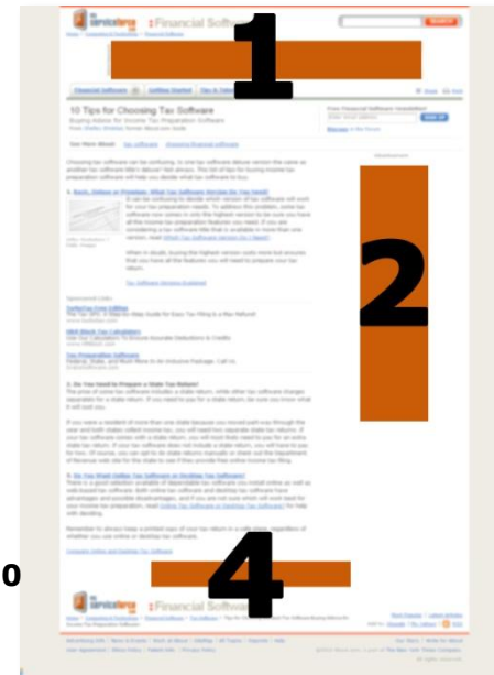
Main Content Page Placements - 1